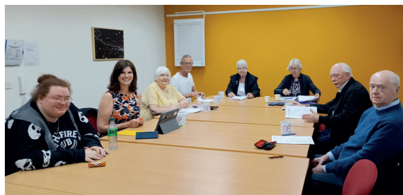
The Executive Committee

Once again, the Executive Committee (EC) is delighted to share our Annual Report with you, and hope it gives you a flavour of the work we do, and maybe encourages you to become a member or get involved in some of our activities.