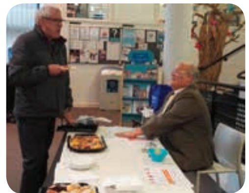
Members of the Rent Matters Working Group worked closely with the Council in this year's rent consultation