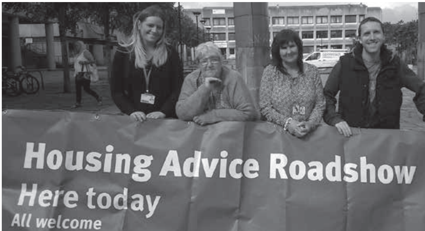
ETF and Council representatives at the Roadshow at Westside Plaza

ETF and the Council held a Roadshow in TESCO Duke Street, Leith on Monday 7th September 2015 and an update will be given in the next edition of Tenants Voice .