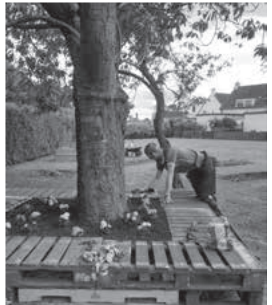
One of our volunteers in the Community Garden

Through the classes you will also have the opportunity to access advice to help you better manage your money.