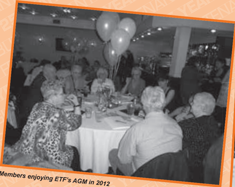
Members enjoying ETF's AGM in 2012