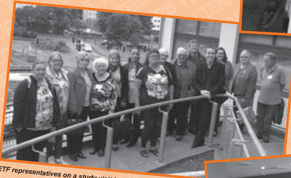
ETF representatives on a study visit in Dundee in 2014