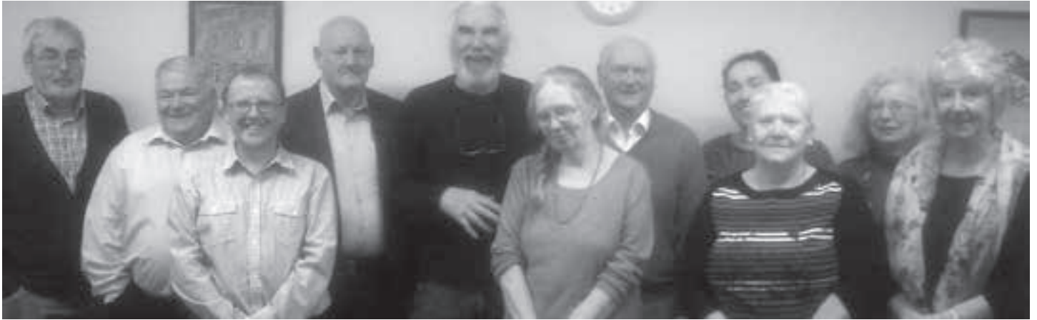
Representatives at the inaugural Edinburgh RSL Network Residents meeting

The Inaugural Meeting of Edinburgh Registered Social Landlords (RSL) Residents Network took place in April 2015 at Norton Park. A Committee of eight residents was elected and four Office Bearers were appointed.