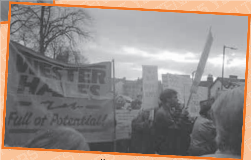
Housing conditions demonstration in the 1990s