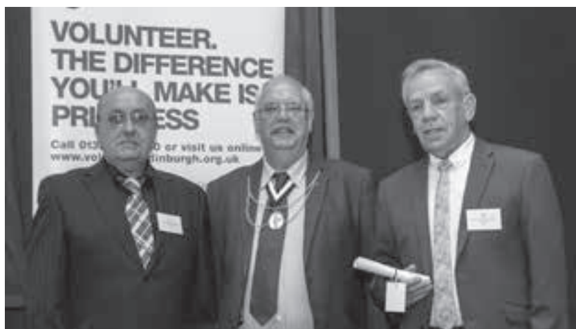
Calder's Sheltered Housing tenants receiving their award at the Volunteer Awards Ceremony

Congratulations are also due to the Calder's Sheltered Housing Complex as they received a Team Award for the outstanding work they carry out in their area.