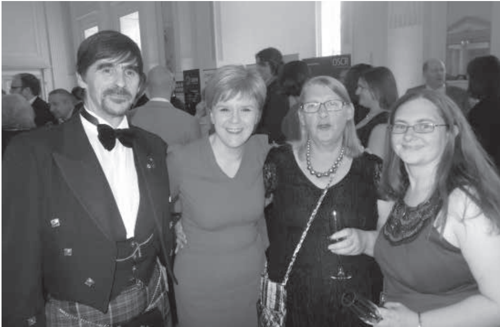
Calders' Committee Members with the First Minister

Congratulations to Calders Residents Association for reaching the finals of the Scottish Council for Voluntary Organisations (SCVO) Awards where they were nominated in the Celebrating Communities category. The award was eventually won by Beith Community Development Trust, however Calders Residents Association were thrilled to be chosen as one of the five finalists from the whole of Scotland. First Minister Nicola Sturgeon attended the award ceremony and commended and recognised all the work done by the groups.