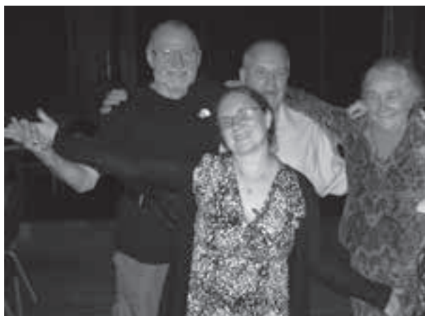
Having fun at the AGM!