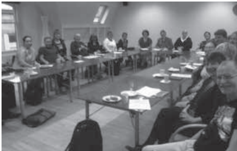
The Human Rights Information Session at the Melting Pot