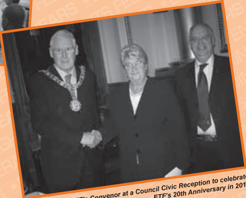
ETF's Convenor at a Council Civic Reception to celebrate ETF's 20th Anniversary in 2010