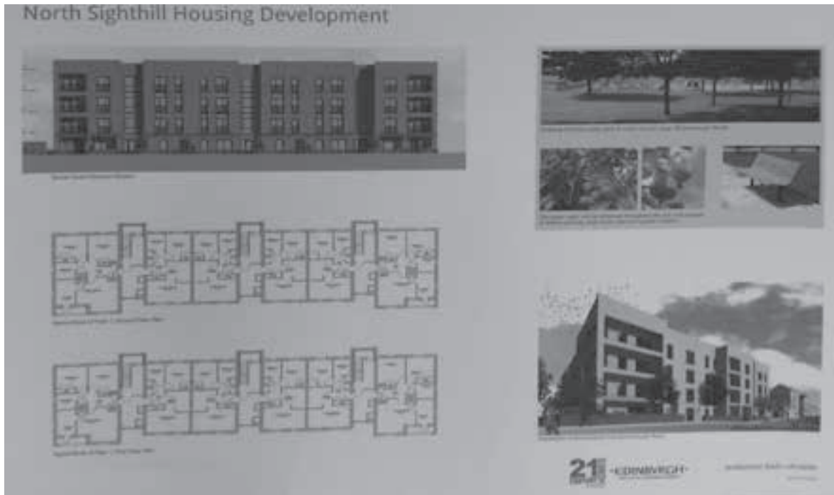
Some of the proposed plans for the North Sighthill Development

Market testing showed there was a higher demand for houses than flats; therefore more houses are now proposed. As a result of this, and to ensure there is no major reduction in the number of homes on the site, the height of some of the blocks of flats around the edge of the site have been increased from three storeys to four storeys. Although the Council and private homes will be in different parts of the site, the Council is seeking a tenure blind approach similar to that successfully used at the 21 st Century Homes Gracemount development; where private and affordable housing look the same.