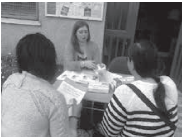
Residents at the energy advice session

An energy advice session was also hosted at the community flat where residents were invited to find out more about how they can reduce their energy costs.