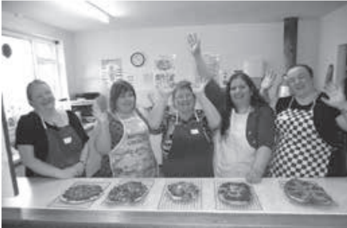
Our cookery classes

Helping Hands is a new project being delivered in the South East of Edinburgh by Fresh Start and we are looking for you to get involved.