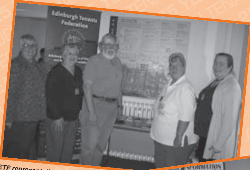
ETF representatives hosting a Norton Park Coffee Morning in 2009