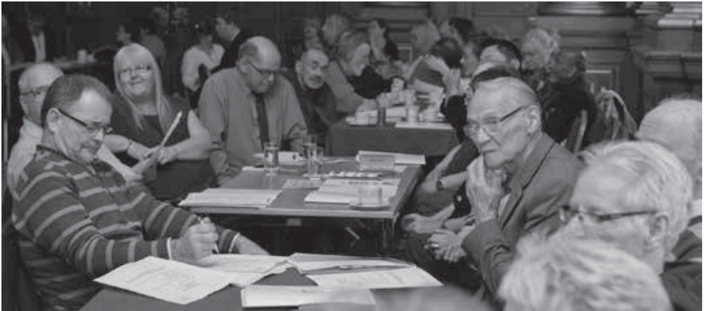
A great turnout at our AGM, including old and new faces

ETF's Annual General Meeting (AGM) promised to be one of the highlights of the year and it certainly did not disappoint. With a mixture of new and familiar faces in attendance the feedback from the event has been extremely positive. Our membership attending the AGM approved the Federation's workplan for 2015/16.