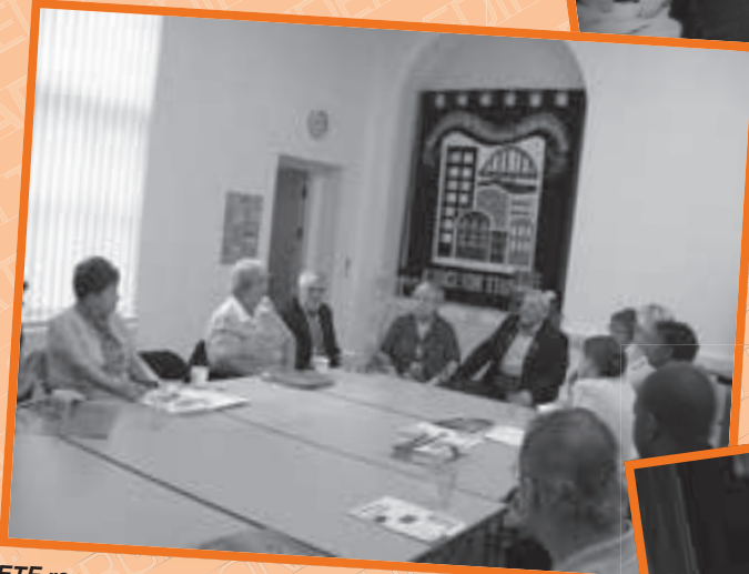
ETF representatives visiting the Newcastle Tenants Federation in 2010