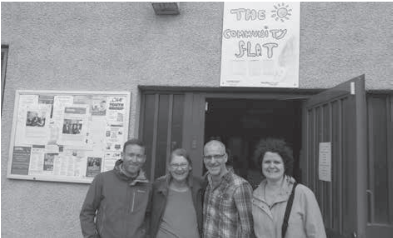
The Calders Community Flat