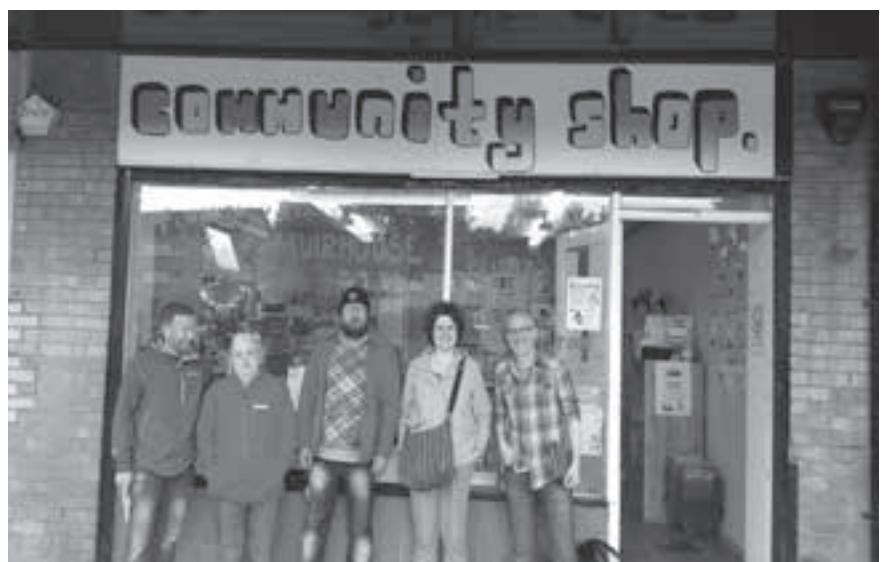
The Muirhouse Community Shop