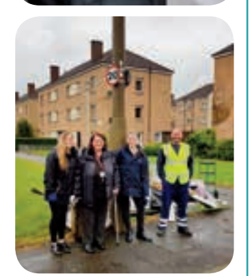
CEC staff taking part in the community clean up

City of Edinburgh Council (CEC) staff carried out 18 local events last year and have 20 scheduled for this year. The latest was at Broomhouse on 10th July 2019. The event went very well in spite of the wet weather. In total eight tonnes of items that tenants wanted to dispose of were uplifted. There was good engagement from residents