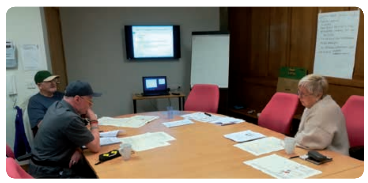
ETF's Focus Group formulating a response to the consultation

A copy of ETF's response to Strengthening Fire Safety for High Rise Domestic Buildings can be downloaded from our website at <a href="http://www.edinburghtenants.org.uk/wp-content/uploads/2019/07/Strengthening-Fire-Safety-for-High-Rise-Domestic-Buildings-July-2019.pdf">http://www.edinburghtenants.org.uk/wp-content/uploads/2019/07/Strengthening-Fire-Safety-for-High-Rise-Domestic-Buildings-July-2019.pdf</a> or you can phone Mark on 0131 475 2509 or email <a href="mark@edinburghtenants.org.uk">mark@edinburghtenants.org.uk</a>.