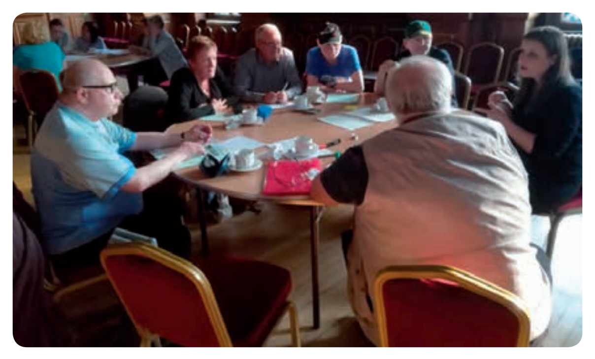
Discussions taking place at the Federation Meeting