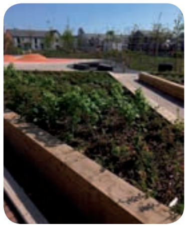
We've also completed 75 new CEC homes at Greendykes in Craigmillar. These are a mix of social homes and homes for midmarket rent.