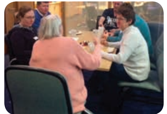
Leadership programme in full flow

Sitting in on the first morning of this programme it was clear there is real enthusiasm and positive ideas on how to create change within our local communities. One of the key goals of leadership is empowering others to find their voice but first of all it is important to ensure that we are supporting our active community members to recognise themselves as leaders. Looking around the room it was great to see such a diverse group, who are of all ages and have seized the opportunity to develop themselves, as well as use this experience to unlock the potential of their community at the grassroots level.