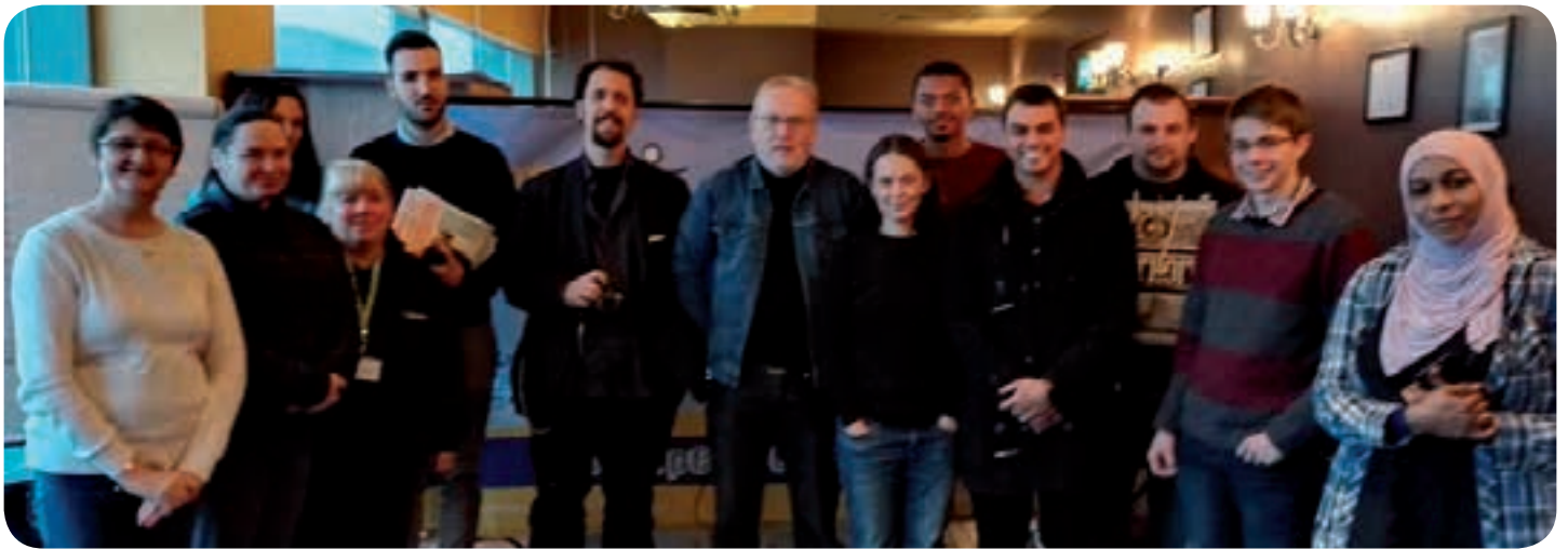
ETF representatives meet with participants in one of the workshops