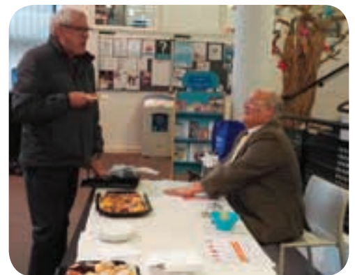
Members of the Rent Matters Working Group worked closely with the Council in this year's rent consultation