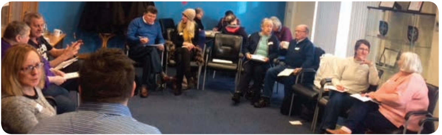
Tenants' representatives taking part in the leadership programme

These issues provide challenges, as well as opportunities and through this programme the tenants will focus on positive strategies and build upon the strengths of their communities. One tool that Luci will help the group to make use of is a community based approach called 'Appreciative Inquiry'. This is based on four key areas: