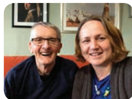
Two of the Meal Makers participants