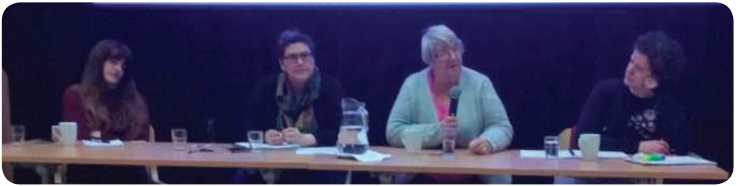
The Panel answering questions after the I, Daniel Blake screening

To get involved in the campaign for advocacy rights in supporting people to negotiate the welfare system, please phone 0131 557 6242 or email ecap@lists.riseup.net .