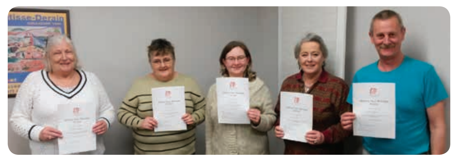
Delegates receive their certificate for completing the course

Some of the feedback from the session included