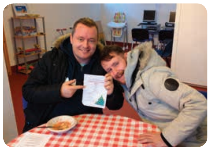
The community kitchen has proven to be very popular