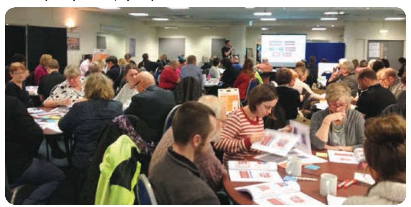
A consultation event held to discuss developing LIPs

We have been asking for people's views to help us to do this, as it's vitally important that our citizen's views are at the heart of the Locality Improvement Plans. We've carried out the first phase of engagement, listening to those people living, working or visiting the wider locality about their views on how each area could be improved in the next five years around the following five themes: place; health, social care and wellbeing; children, young people and families; community safety; and employability.