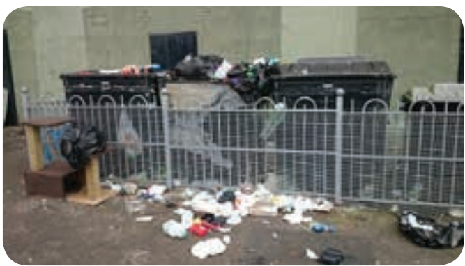
Some of the problems regarding waste services in the area