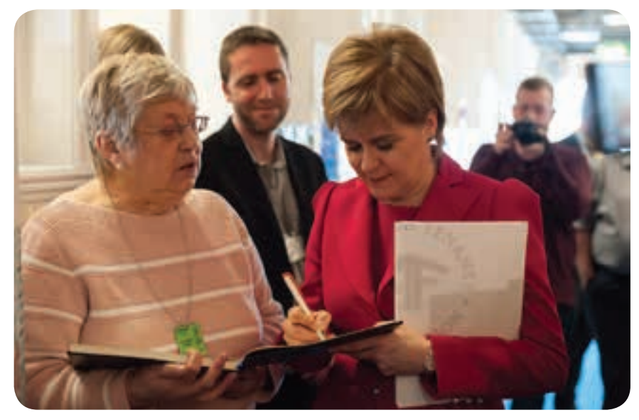
The First Minister signing ETF's visitor book

The Federation's Executive Committee recently approved a statement on behalf of its Members opposing the introduction of the "Rape Clause" saying "Edinburgh Tenants Federation is disgusted by the introduction of the "rape clause". This is an inhumane policy that should never have been approved. We call for the UK Government to rethink this law. Women should never have to disclose that their child has been conceived as a result of rape or coercion in order to receive state benefits."