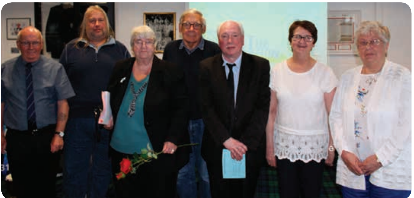
ETF's Executive Committee

Thanks to all that attended and the hard workers who got us here; the Executive team, staff and all of us, the volunteers.