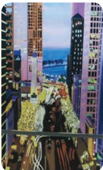
Chicago housing as public art

I spent three days in Chicago touring community projects, learning about how community and public art, community gardens and local fun days have become a focus in alleviating poverty through practical means. Division Street Fest for example, is a neighbourhood street festival organised by the community to raise funds and awareness for local foodbanks.