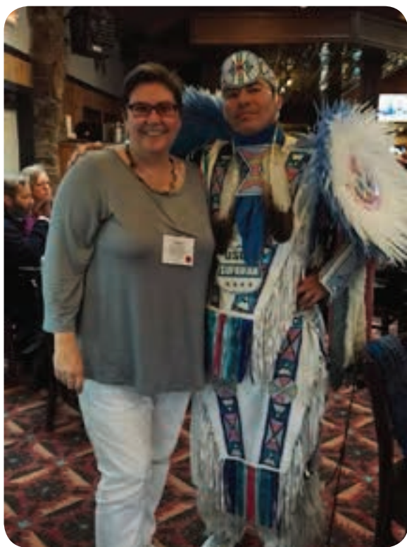
Clare with Hip Hop Community Development legend Supaman

There were many more highlights of the conference, including using hip hop as a tool for community development, learning about indigenous rights through seminars with Tribal Leaders who fought against the installation of a pipeline through sacred lands at Standing Rock, a mobile learning workshop to Yellowstone National Park, as well as learning about Ripple Effect Mapping – a new participatory storytelling tool to evaluate community development programmes and digital participation to form online communities.