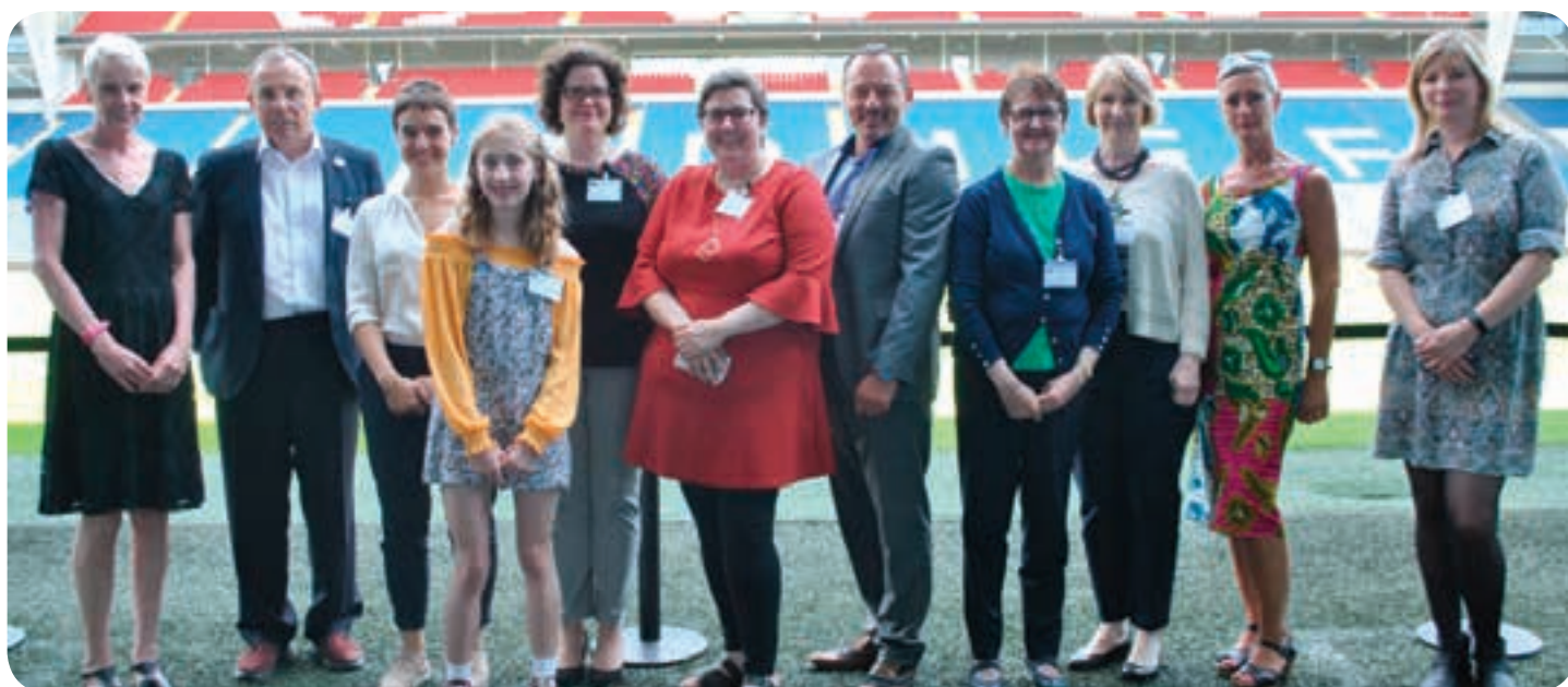
ETF and SHRC representatives with their Welsh counterparts and speakers at the Conference

General feedback from the event was that delegates felt better informed and re-energised to continue to work towards developing human rights based approaches to service delivery, and to advance the equality and human rights agenda in Wales. Many delegates identified the ETF presentation as the highlight of their day. Delegates commented that the presentation was very inspirational and hearing from an actual tenant brought the case study to life.”