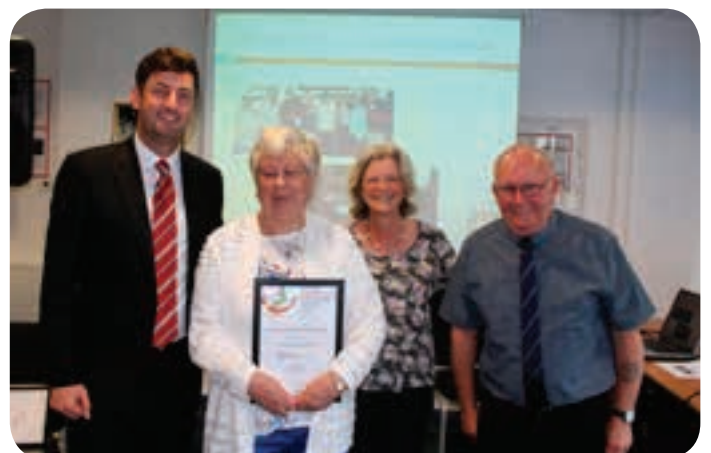
Members of the Sheltered Housing Liaison Group