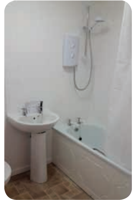
The kitchen and bathroom show flats