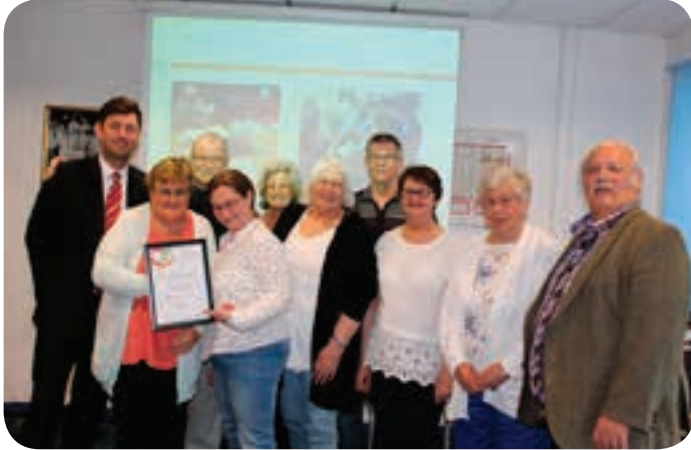
The Tenant Led Inspection Group

Tenant Led Inspections – This group of tenants has been instrumental in digging deeper into the way Council housing services work in order to make recommendations for improvements.