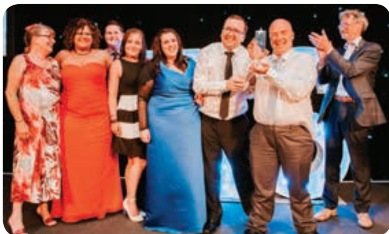
TRIM and FoWP receiving the award at the TIS Awards Ceremony

TRIM and FoWP covers all tenants and residents in Muirhouse & West Pilton – from council, housing association, private lets and owner occupiers. We want to work in partnership with all groups and landlords to make Muirhouse a better place to live for everyone. We aim to build on the positives, deal with the negatives and take an active part in the regeneration of the area.