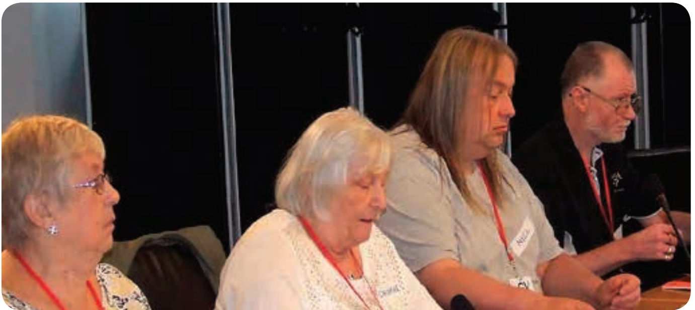
ETF representatives at the Scottish Parliament