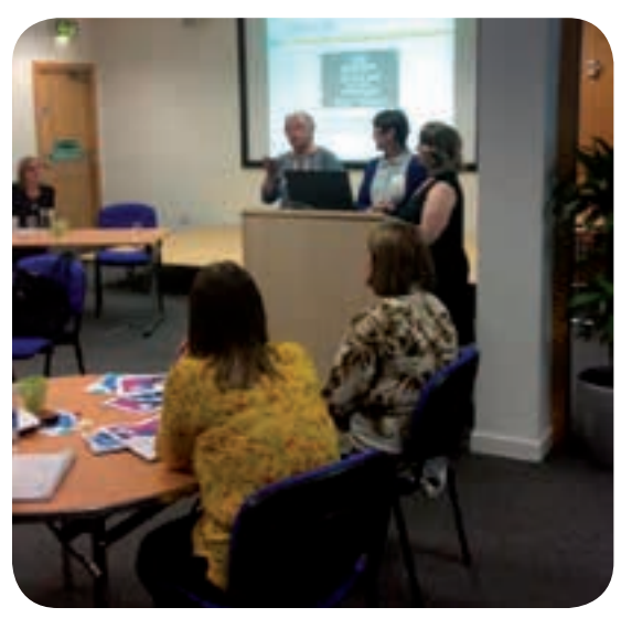
Inspectors speaking at Housemark event

I'm sure 2017 will be just as busy a year for our TLI team, but we're looking forward to it. Bring it on!