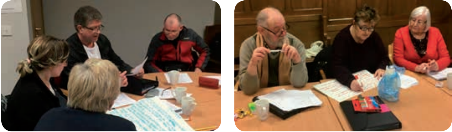
Our TLI Team planning for the Rent Collection Communication Inspection

We are currently in the process of planning our forthcoming inspection looking at the Council's communications with tenants in the Rent Collection Process. We have held a number of meetings with the Council to firm up on the purpose and methods which will be used in the inspection. We are hoping to start carrying out the fieldwork by the beginning of December; this will include interviewing staff and speaking to tenants to find out if they have any suggestions for improving the Council's ways of communicating. There will be an update on our progress in the next edition of Tenants Voice .